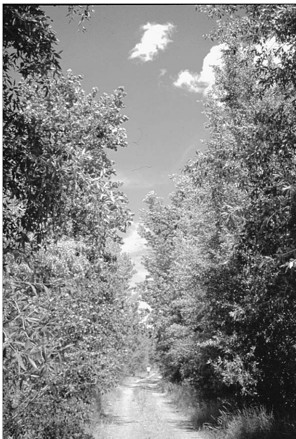
PLATE 1. Common garden, Ogden Nature Center, Ogden, Utah, USA.

in arthropod community composition than species or hybrid cross type (Shuster et al. 2006). Moreover, the patterns of broad-sense heritability of arthropod community composition followed a similar gradient with the highest H_C^2 occurring in the P. angustifolia and backcross hybrids and the lowest H_C^2 in P. fremontii (Shuster et al. 2006). The consistency of these two studies suggests that there are similar patterns of genetic variation within the pure and hybrid cross types (i.e., low genetic variation in P. fremontii and high genetic variation in P. angustifolia ), which is consistent with past research (Keim et al. 1989).